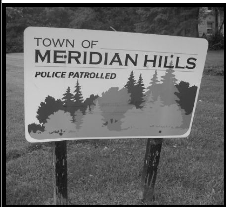
Current Town Entry Sign

Please be considerate of your neighbors and the many pedestrians and bicyclists throughout our Town. In Marion County, dogs are required to be on a leash on public streets or rights-of-way. If you encounter an aggressive dog that poses an immediate threat or emergency, please call 911. If you'd like to report an owner or a dog that chases walkers or bikers in the street, please call the Mayor's Action Center at 327-4622 and an Animal Control officer will respond within 48 hours. Thanks for your cooperation!