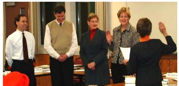
The new Town Council being sworn in.

The regular Town Council meetings take place the second Monday of every month at 7:30 pm, and are currently held in the Hilbert Early